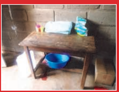
A girls' room at a primary school in the Rwinkwavu sector, Rwanda.

After our Breaking the Silence campaign in 2010, the Ministry of Education allocated 282,300 RWF ($461 US) to each primary and secondary school to set up a girls' room, a private space that allow girl to manage their menstrual hygiene needs discreetly and safely while at school. SHE played a big role in instigating change, and while this is a great first step in the right direction, we still have a ways to go!